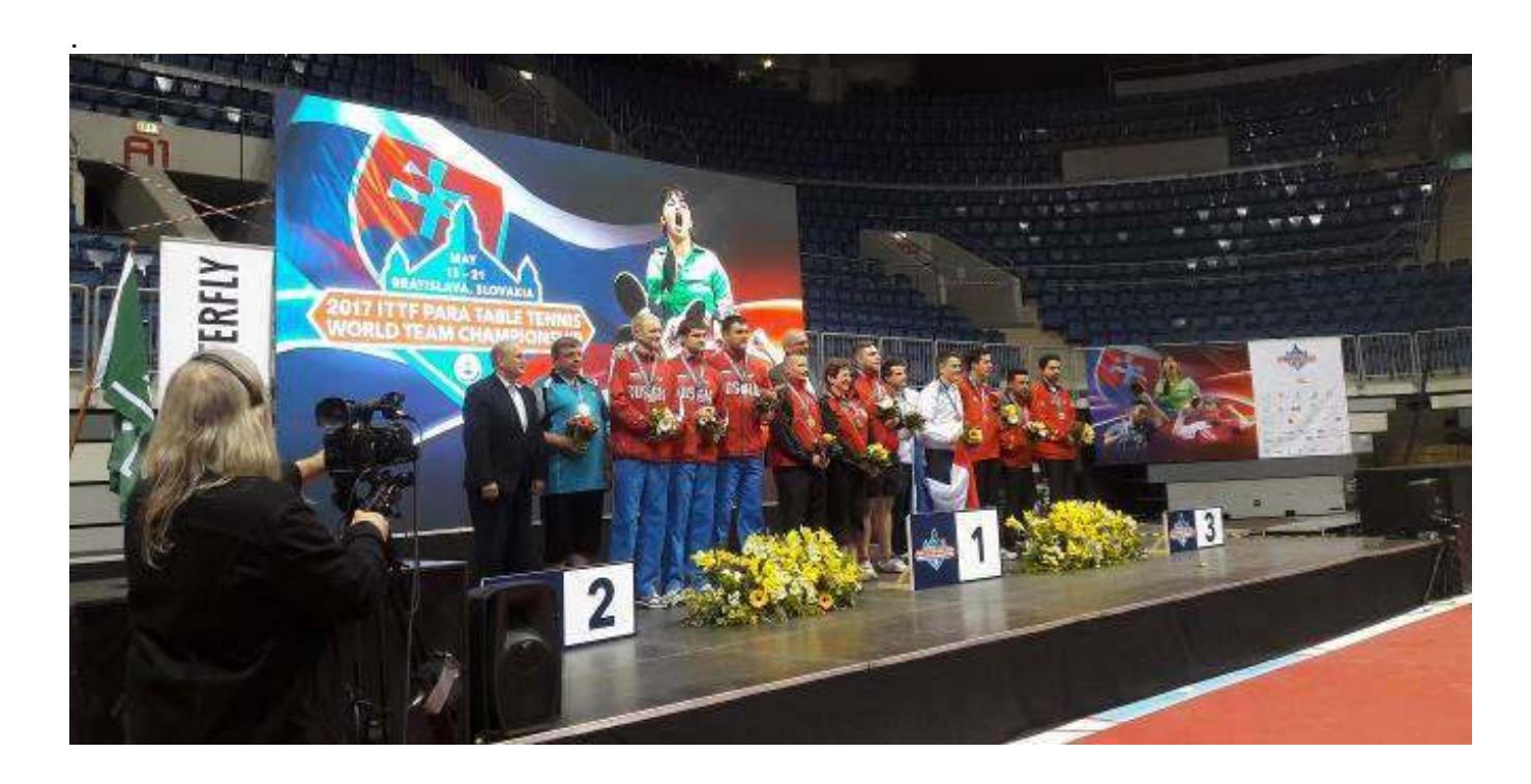
Fair Play Award during the Closing Ceremony: