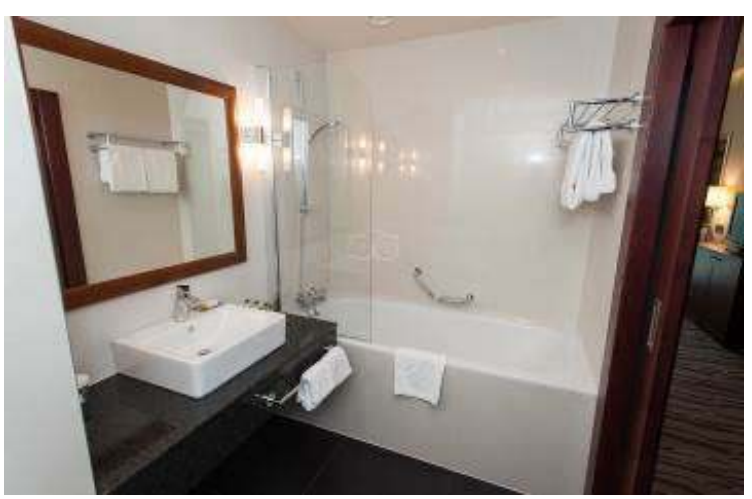
Lindner Hotel **** Metodova 4, Bratislava www.lindner.de/sk/hotel_bratislava

About 10 minutes to the venue by the official transport. Used for participants and staff. Excellent quality.