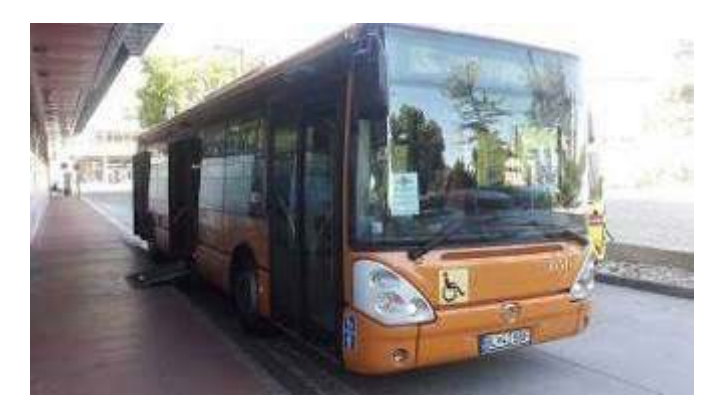
5 accessible busses and mini Vans

A regular shuttle was organized only between the hotel Lindner and the venue every 30 minutes; The hotel Double Tree by Hilton was only 300 meters to the playing hall so transport was not required.